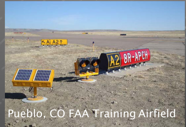
Pueblo, CO FAA Training Airfield