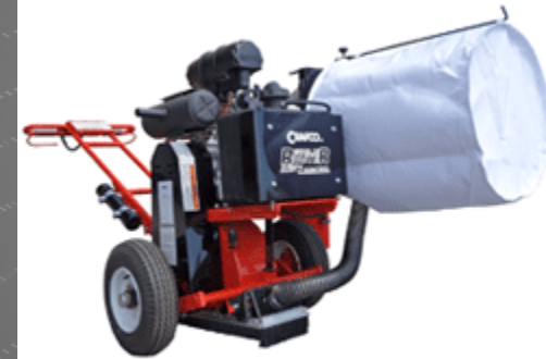
Eco-Router Dust Control