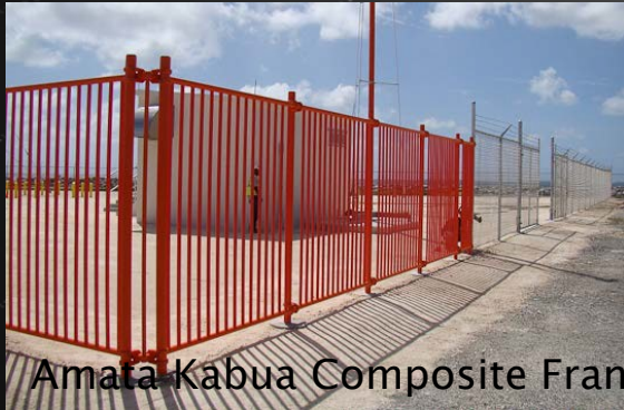
Amata Kabua Composite Frangible Fence