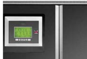
Critical Power Distribution