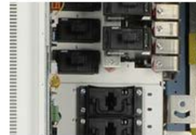
DC Power Systems