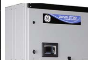
Automatic Transfer Switches