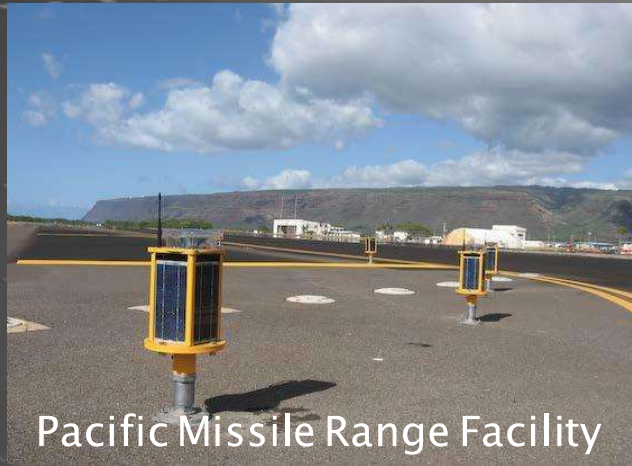
Pacific Missile Range Facility