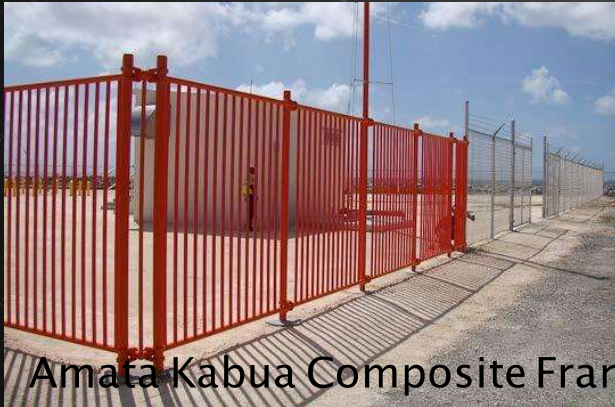
Amata Kabua Composite Frangible Fence