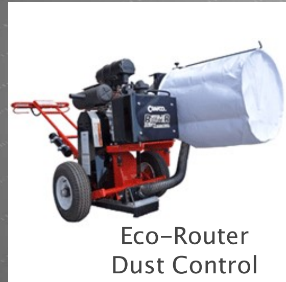
Eco-Router Dust Control