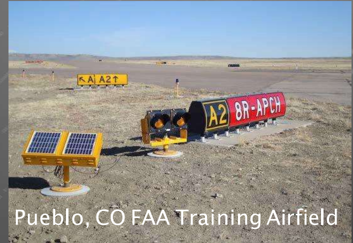
Pueblo, CO FAA Training Airfield